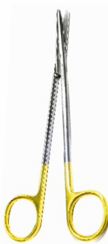
T.C. Tip 1502.2 Straight & Curved 4", 5", 6", 7", 8"