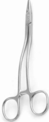
Bozeman 1510.2 - Angular 6"