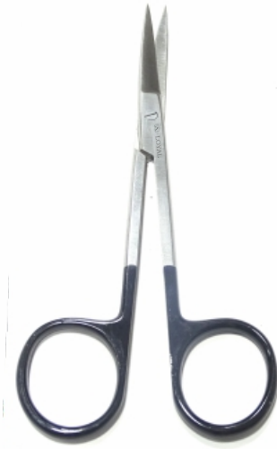
Super Cut 1501.1 Straight & Curved 4" & 5"