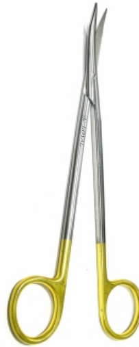
T.C. Tip 1503.2 Straight & Curved 4", 5", 6"