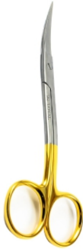
T.C. Tip 1504.1 - Curved 5"