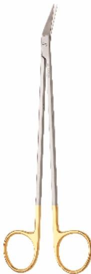
T.C. Tip 1506.1 - 45° & 60° 7"