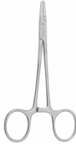
Ryder 1510.3 - Straight 4", 5", 6", 7"