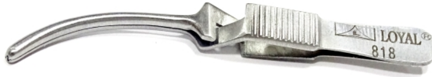
Straight & Curved 1560 38mm/1", 51mm/2", 57mm/2.1/4", 63mm/2.1/2", 75mm/3