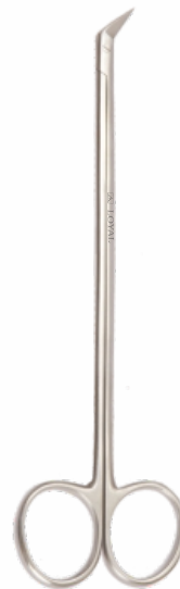
S.S. 1506.2 - 45° & 60° 7"