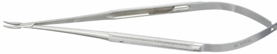
Micro Needle Holder S.S.