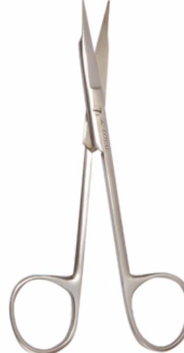
S.S. 1503.3 Straight & Curved 4", 5", 6"