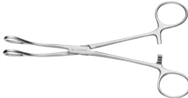
Sponge Holding Forceps