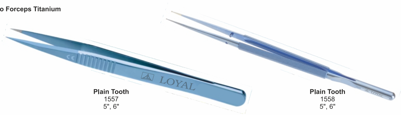
Plain Tooth 1557 5", 6"