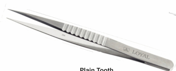
Micro Forceps S.S.