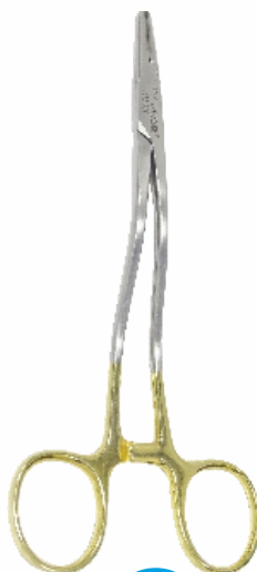
Bozeman 1509.2 - Angular 6"