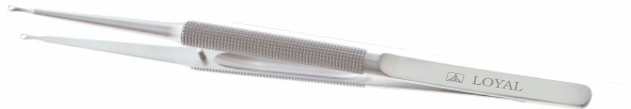
1559 5", 6"