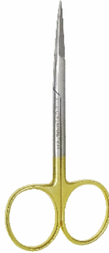
T.C. Tip 1501.1 Straight & Curved 4" & 5"