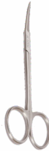
S.S. 1501.1 Straight & Curved 4" & 5"