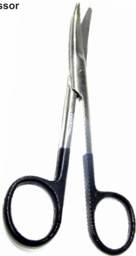
Super Cut 1505.1 Straight & Curved 5", 6", 7", 8"