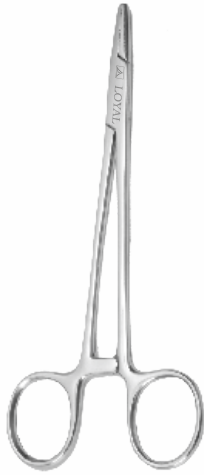
Mayo (Debakey) 1510.1 - Straight 4", 5", 6", 7"