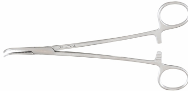
Mixer Artery Forceps