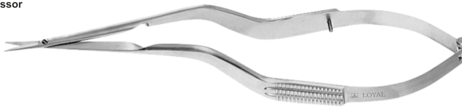
Micro Bayonet Scissor