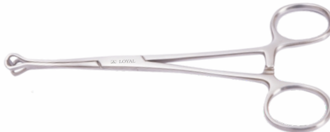
Babcock Tissue Forceps