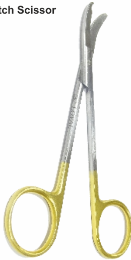
T.C. Tip 1507.1 Curved to Side 5"