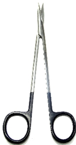
Super Cut 1503.1 Straight & Curved 4", 5", 6"