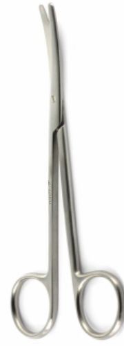
S.S. 1502.3 Straight & Curved 4", 5", 6", 7", 8"