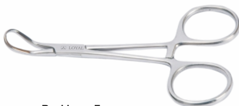
Backhaus Forcep 1523.1