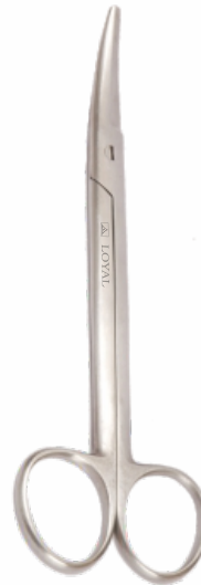
S.S. 1505.3 Straight & Curved 5", 6", 7", 8"