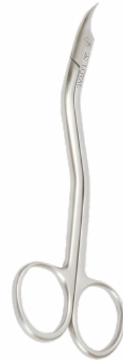
S.S. 1507.3 - Curved 4" & 6"