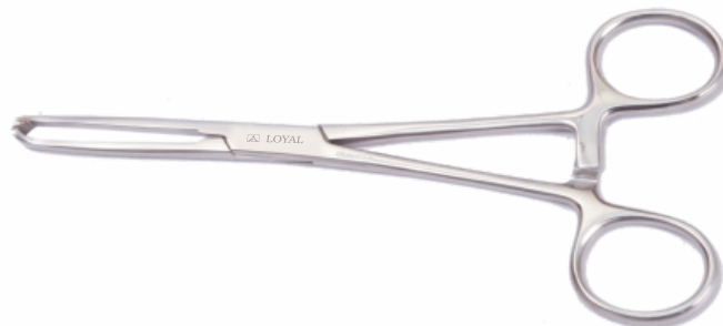
Allis Tissue Forceps