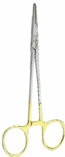
Mayo (Debakey) 1509.1 - Straight 4", 5", 6", 7"