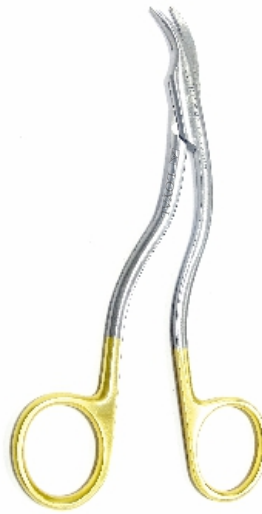
T.C. Tip 1507.2 - Curved 4" & 6"