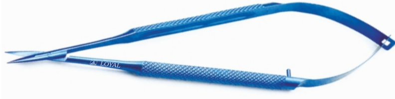
Micro Scissors Titanium