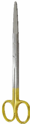
T.C. Tip 1505.2 Straight & Curved 5", 6", 7", 8"