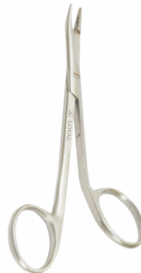
S.S. 1508.2 - Curved 5.5"