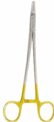
Ryder 1509.3 - Straight 4", 5", 6", 7"