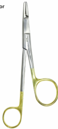
T.C. Tip 1508.1 - Curved 5.5"