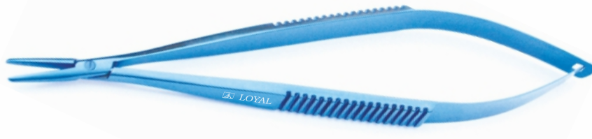
Micro Needle Holder Titanium