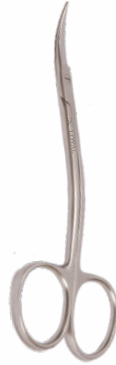
S.S. 1504.2 - Curved 5"