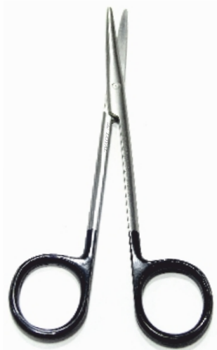
Super Cut 1502.1 Straight & Curved 4", 5", 6", 7", 8"